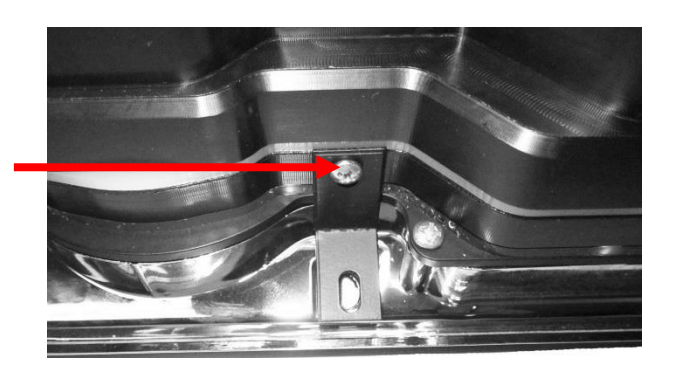
Both brackets mounted to the bottom side of the RTX system

End of bracket with shorter slot mounts to the RTX system using supplied 3/8" screw